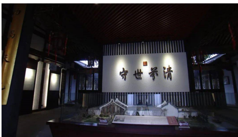
Figure 1. Qian clan ancestral hall

This study takes the Qian clan in Haiyan County, Jiaxing, Zhejiang Province, as the main research object. Originating from Qian Liu, the King of Wuyue, the Qian clan moved to Haiyan in the Ming Dynasty and gradually developed into a clan group with significant cultural influence ( Figure 1 ). The Family Motto of the Qian Clan, as the core document of the clan, centrally embodies the values of loyalty, filial piety, integrity, diligence, and frugality, and puts forward normative requirements for individual self-cultivation, family harmony, social responsibility, and national commitment. The selection of the Qian clan as a research case is due to two reasons: on the one hand, its family tradition culture is representative; on the other hand, its values are highly consistent with the core socialist values of the contemporary era, which provides a typical example for cross-cultural communication research.